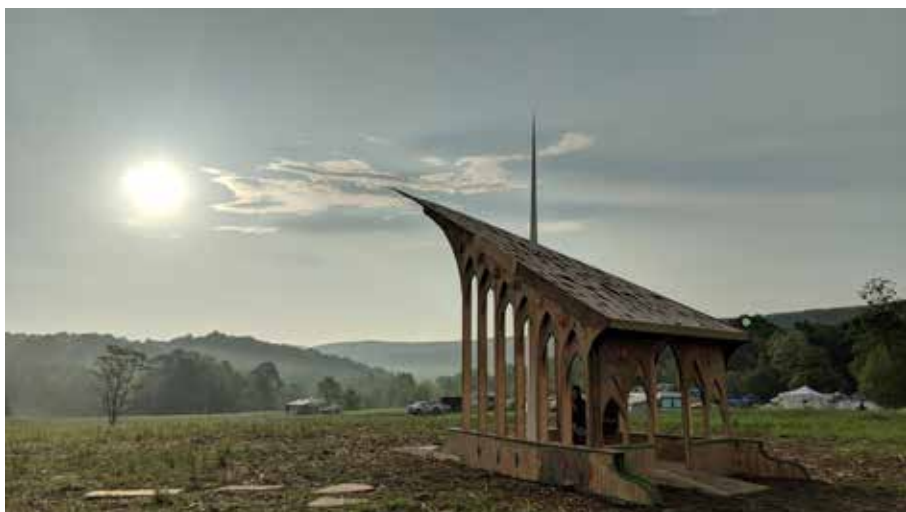
Spirit Rises by Michael Verdon

pre-configured so your design will connect to anyone else's design. The tile is pre-magnetized. Stick your creation on the fridge door (also provided), and connect it to others' tiles. Rearrange the tiles into whatever design suits your mood. If you can hold a permanent marker, you can do this! Afterward, come take your unique, excellent fridge magnet home with you as a memento of PDF 2024.