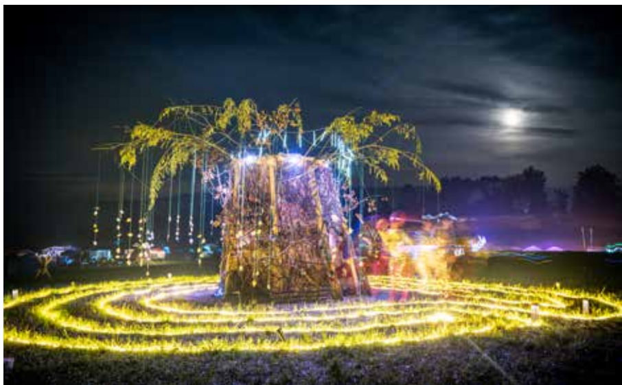
AncesTree Temple by Shanna 'Banana,' Todd 'Skipper' & Caryn 'Maybe' - Photo by Jeffrey Stoltzfus