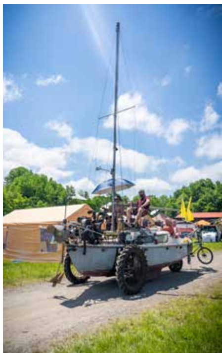
The Killadelphia Experiment Art Car

Location: Wiggle Zone Audience: 18+ Only (adult content) Event Type: Class/Workshop, Miscellaneous, Sustainability/Greening Your Burn