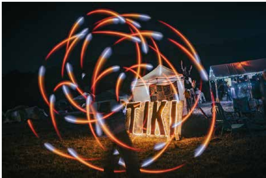
TIKI Theme Camp - Photo by Jeffrey Stoltzfus

Find refuge and rest a while in our intimate cheesy abode. Join in some conversation around the fire pit, lie down in our garden cuddle puddle, or join in some conversation in our shaded queso lounge and Chochin Obake food care. During the day, take some time to rest a while with us and in the evening if you're lucky enough to catch us we may be serving some tasty treats. We are a queer-loving, comfortable,