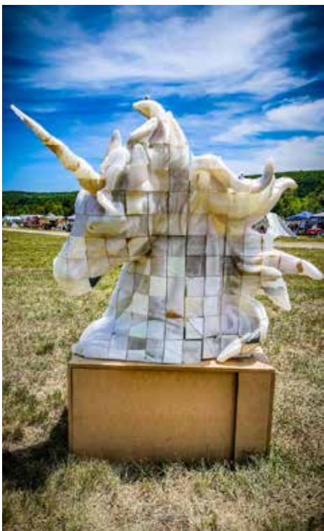
RAINBOW UNICORN by Todd Blatt and the We The Builders Community

After an 8-year absence, the one, the only, the original is back! For the uninitiated, it's exactly what it sounds like: Have you forgotten something for that wiener? Need to lube something or spice something up? We've got you covered! Come by the C&C station, open the